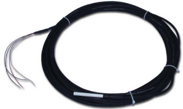
Each 107 or 108 probe requires one single-ended channel for measurement.

Please note that the 107 and 108 are not compatible with the CR200-series dataloggers. However, a similar thermistor, the 109, has been developed specifically for our CR200-series dataloggers.